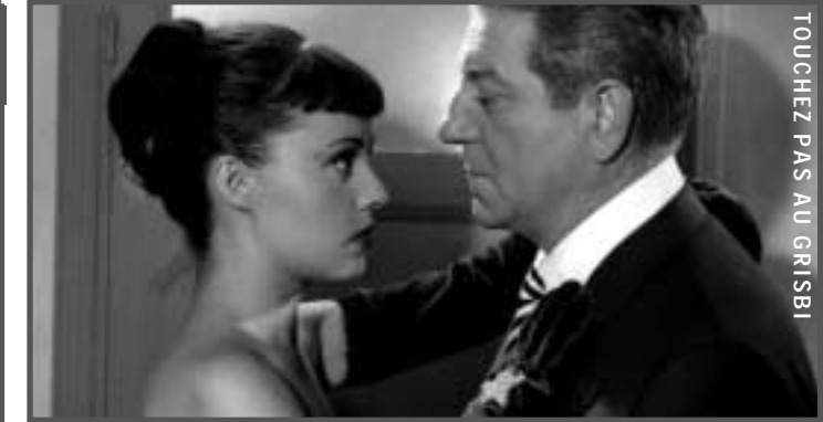
TOUCHEZ PAS AU GRISBI

Plus! The Brattle is now offering a Student Discount of $1.50 off Regular Admission!